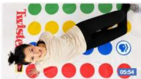
Health The surprising similarities between Twister and intelligence 47,202 views