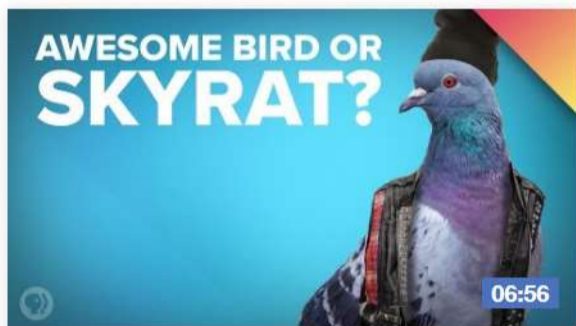
Science & Technology Why does everyone hate pigeons? 1,942,678 views