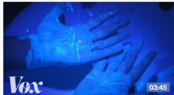
Health How soap kills the coronavirus 10,542,955 views