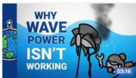
Design, Engineering & Technology Why can't we get power from waves? 1,655,092 views