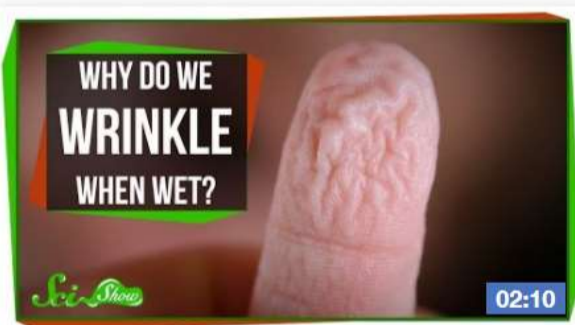
Health Why do we wrinkle when wet? 1,110,692 views

Are you curious, interested in the world or wanting to ace the next general knowledge quiz you do? Then you should come to TED ED Club! It's a place where you can ask anything, and we'll try and find the answers by watching TED talk videos and discussing them. Year 7-9 Tuesday 13:05 in L4 Year 10-11 Wednesday 13:05 in L4