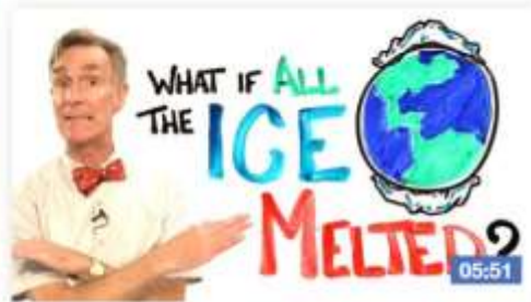
Science & Technology What if all the ice melted on Earth? 7,151,588 views