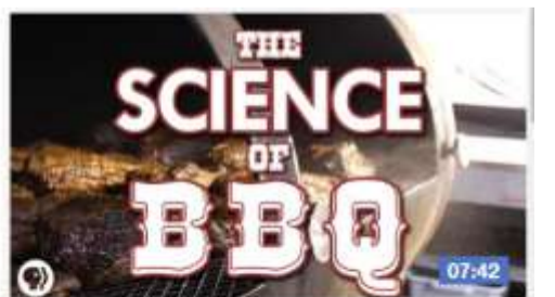
Science & Technology Why does smoked brisket taste so delicious? 539,403 views