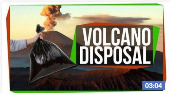
Science & Technology Why don't we throw trash in volcanoes? 1,795,419 views