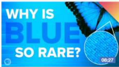
Science & Technology Why is blue so rare in nature? 9,087,405 views