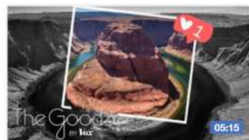
Science & Technology What happens when nature goes viral? 1,517,744 views