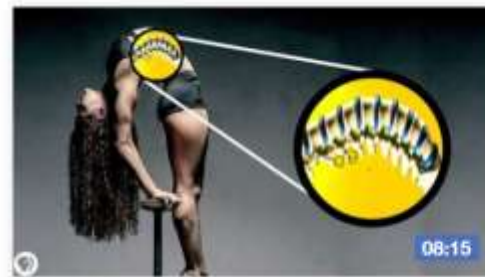
Health What stretching actually does to your body 7,166,259 views