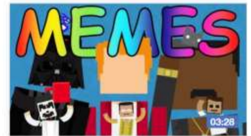
Psychology Why are we so obsessed with memes? 974,286 views