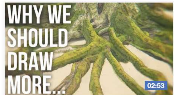
Teaching & Education Why we should draw more (and photograph less) 338,434 views

Are you curious, interested in the world or wanting to ace the next general knowledge quiz you do? Then you should come to TED ED Club! It's a place where you can ask anything, and we'll try and find the answers by watching TED talk videos and discussing them. Year 7-9 Tuesday 13:05 in L4 Year 10-11 Wednesday 13:05 in L4